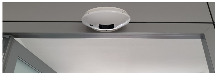
SENSOR LSR-PEOPLE with laser scanner technology for people counting