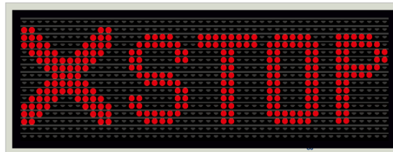
LED DISPLAY with high brightness for outdoor, as an alternative to the monitor